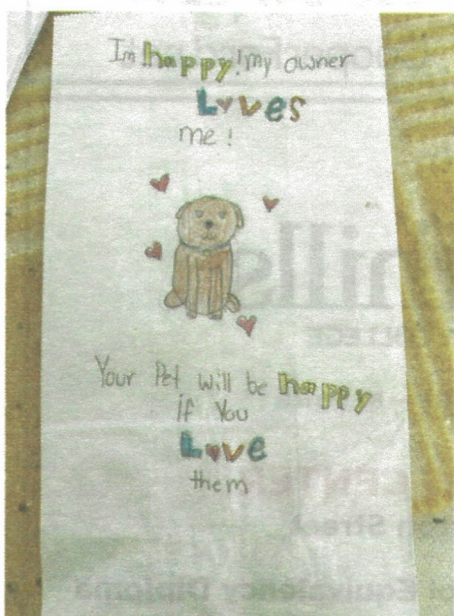
A winning clinic bag with a loving message.