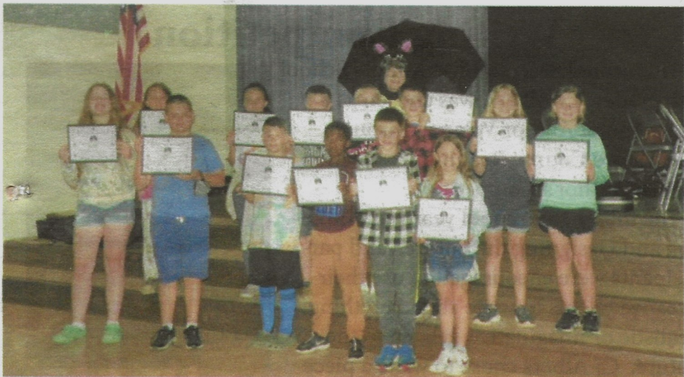
The Speuter Story Contest winners

At the end of April, the fourth graders at Westmoore Elementary School gathered to celebrate their “graduation” from the Pet Responsibility Program.