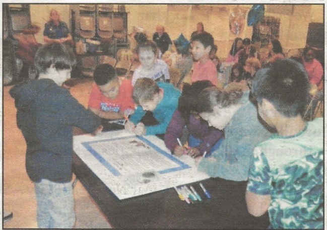
Students signing the Promise Poster

The students recited a Promise together, taking to heart the words they were saying and then signed the Promise Poster, giving their intent to do their best for all animals.