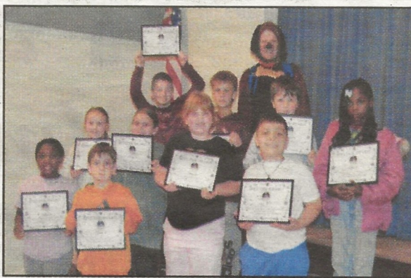
Speuter with the Speuter Story Contest winners