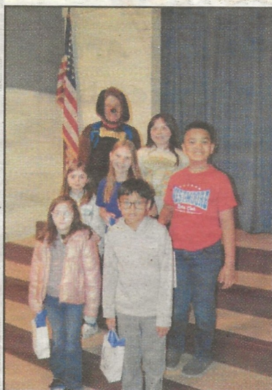
Speuter the PRC mascot with the Star Artist Award winners